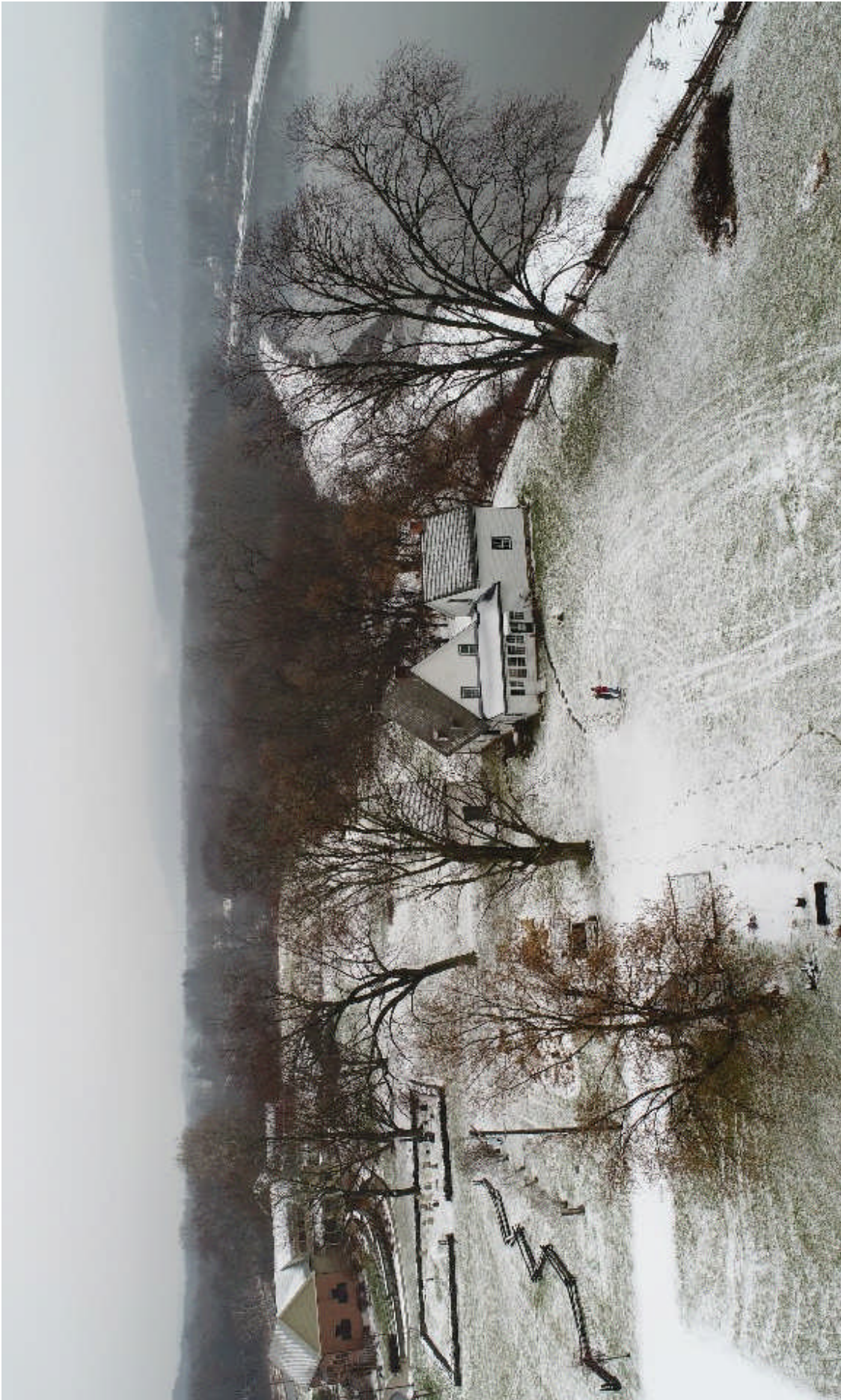
Photo of the Mabee Farm, using a drone after a recent snow fall.