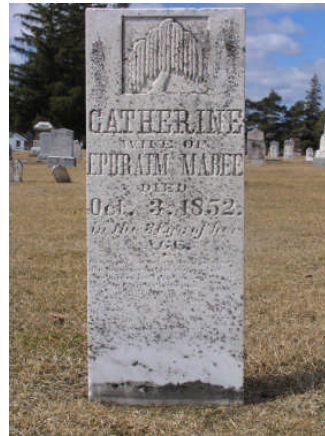
Catherine's marker at Stockdale Cemetery. Note that they shortened 'Maybee' because of lack of room.