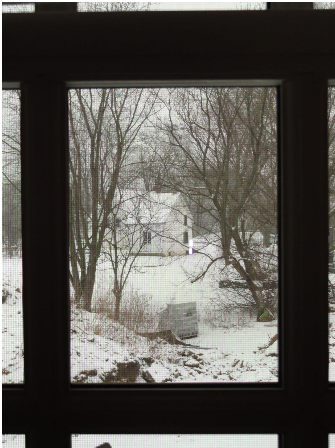
View of the Jan Mabee House in Rotterdam Junction, NY, from the new Franchere Education Center